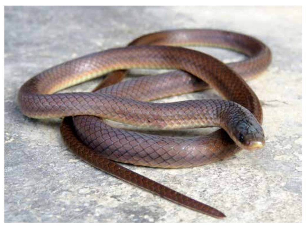
Fig. 1. Liopeltis rappi from Dhodeni, Kabilas, Chitwan.