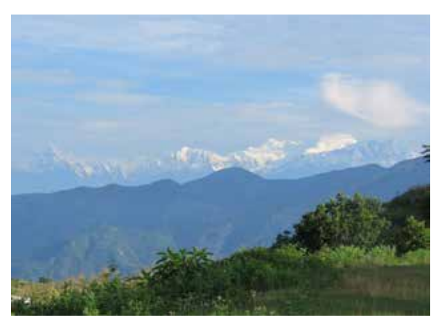
Fig. 3. Habitat of Liopeltis rappi at Dhodeni, Kabilas, Chitwan.

into towns. The present record of the dead specimen from cultivated land tends to show the possible ignorance of local people in the survival of the species. Thapa (2016) recorded five specimens from Palpa, of which four were found killed by local people and a single live specimen from Khaliban. People in this area kill snakes at the moment they encounter them as standard practice in the culture. This rampant killing of snakes, including L. rappi by local people, is an observed threat in the CHAL. All snakes are believed by the local people to be venomous despite the fact that only 17 species of snakes in Nepal are venomous (Sharma et al. 2013). Outreach activities among farmers, local communities, in schools, and colleges should focus on the good ecosystem function of snakes and basic identification tools of snakes would be instrumental in better protecting the snake fauna of the CHAL. Our finding indicates that a countrywide detailed herpetological survey would be beneficial to better understand the ecology, distribution pattern, threats, and conservation status of L. rappi in Nepal.